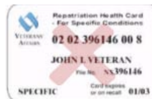
Department of Veterans' Affairs Specific Conditions Card