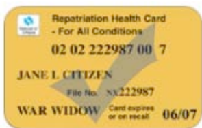
Department of Veterans' Affairs Gold Card "War Widow"