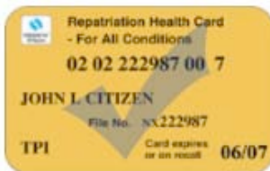
Department of Veterans' Affairs Gold Card "TPI"