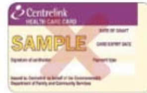
Health Care Card