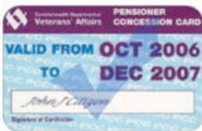
Department of Veterans' Affairs Pensioner Concession Card