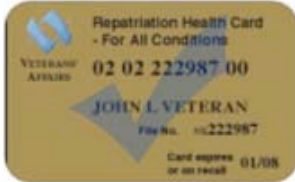
Department of Veterans' Affairs Gold Card